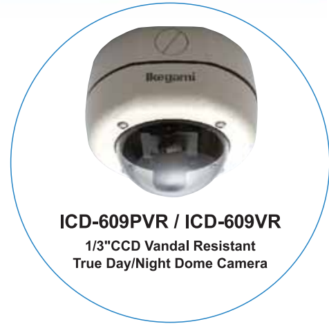
ICD-609PVR / ICD-609VR 1/3"CCD Vandal Resistant True Day/Night Dome Camera