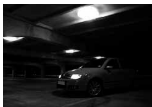
Monochrome mode *