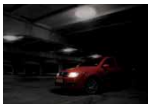
Color mode *

Well designed moving IR cut filter system, inter-connected with the Automatic Gain Control system makes the ICD-609P/609 the ideal Day/Night camera, capable of providing a high quality crisp picture reproduction with 570TVL horizontal resolution under ultra low light conditions down to an amazing 0.08lux/f1.2 (Type31) and 0.12lux/f1.5 (Type92) minimum scene illumination performance.